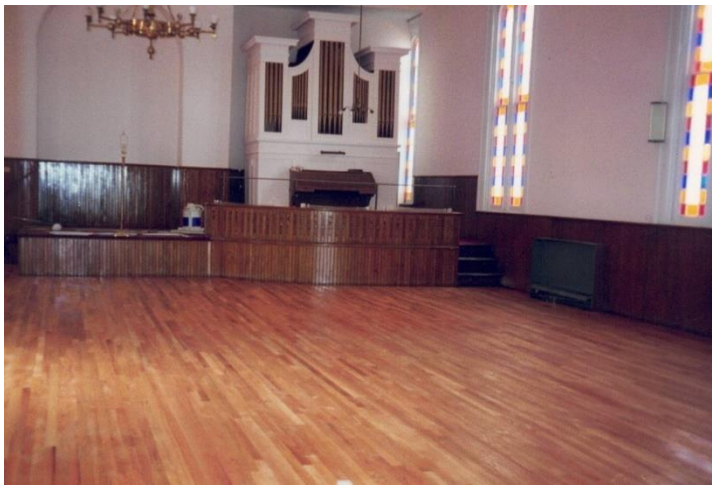
This is probably when the floors in the Sanctuary were refinished. Does anyone know the date?

That's it for this month. There will be more in next month's newsletter.