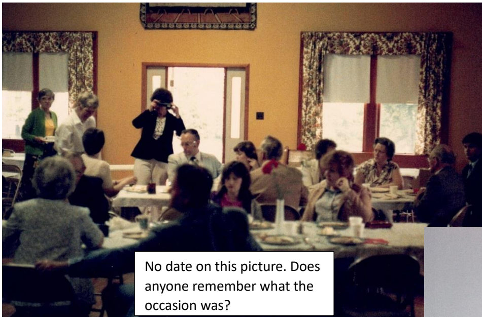
No date on this picture. Does anyone remember what the occasion was?

either undated or the event is not recorded. Therefore, I am asking for your help with some of them so the occasion and the people in the photos can be identified.