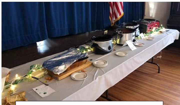
Under the foil – garlic bread – yum!